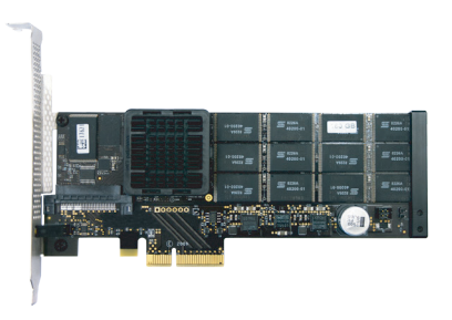
High IOPS Adapter

Retail Customer Custom Web Services Microsoft SQL Server NTFS Microsoft Windows Server VSL High IOPS Adapter