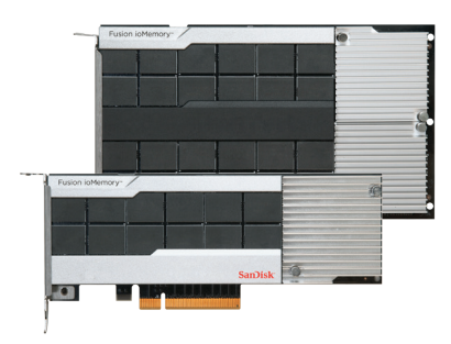
Fusion ioMemory™ - ioDrive2 Fusion ioMemory™ - ioDrive2 Duo