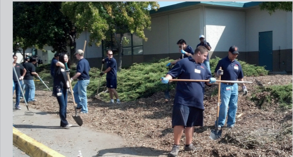
Milpitas: Russell Middle School

the grounds at Russell Middle School in Milpitas - USA.