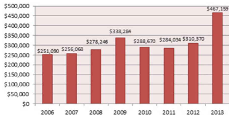
SanDisk Second Harvest Bank Contributions

SanDisk partnered with Stop Hunger Now, a global hunger relief agency to package 150,000 meals for distribution in the Philippines and (via Akshaya Patra) to children and families throughout India. The funds raised in this campaign were used to purchase the food, vitamins and minerals that were packed by SanDisk employees in the US and India.