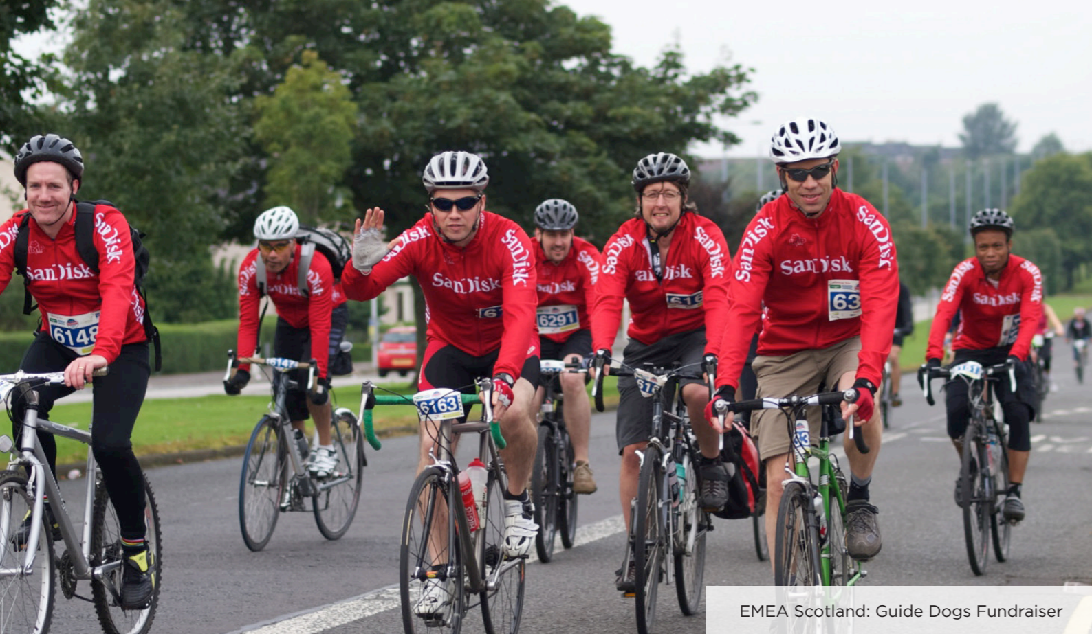
EMEA Scotland: Guide Dogs Fundraiser