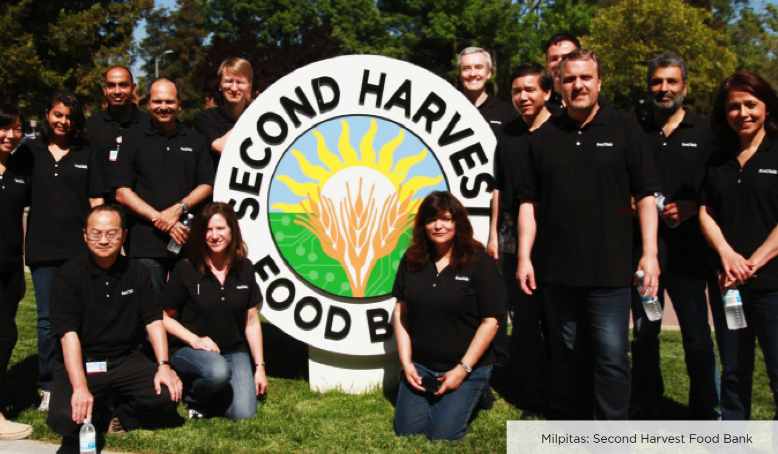
Milpitas: Second Harvest Food Bank

Employees volunteered over 8,500 hours, providing valuable time and materials for Habitat for Humanity