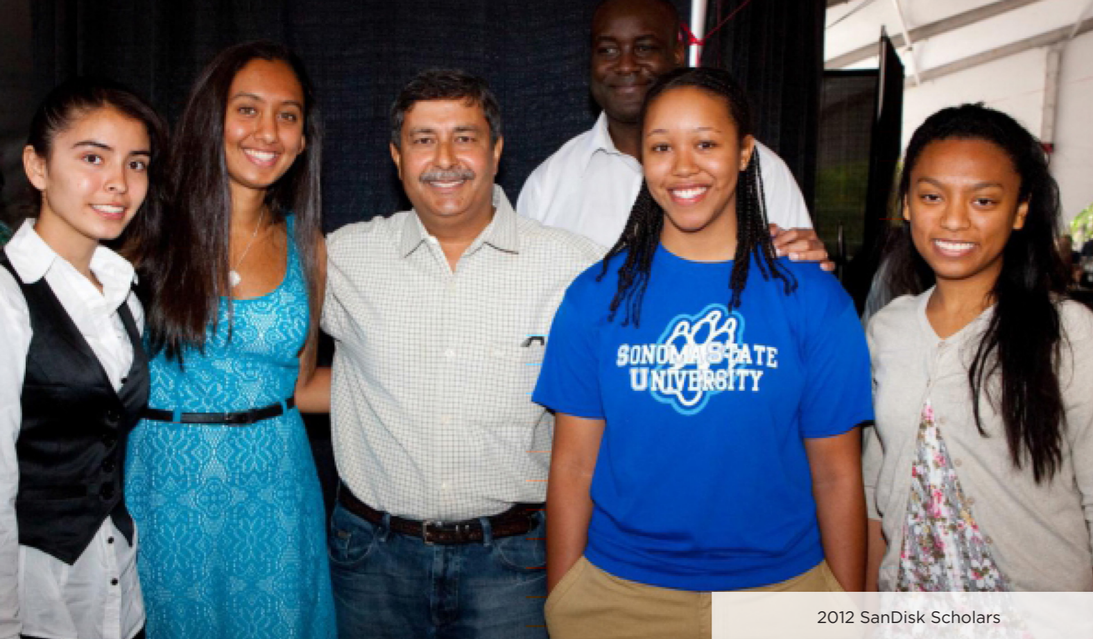
2012 SanDisk Scholars