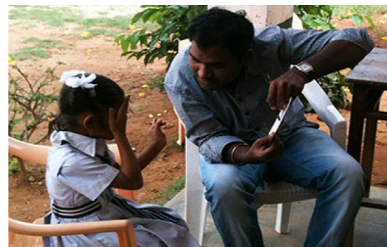
India: Eye Screenings at G.E.H.S. School

In 2013, SanDisk raised over $380,000 for Leukemia and Lymphoma Society's (LLS) cancer research and patient services, making us the leading corporate fundraiser in the country. LLS is the world's largest voluntary (nonprofit) health organization dedicated